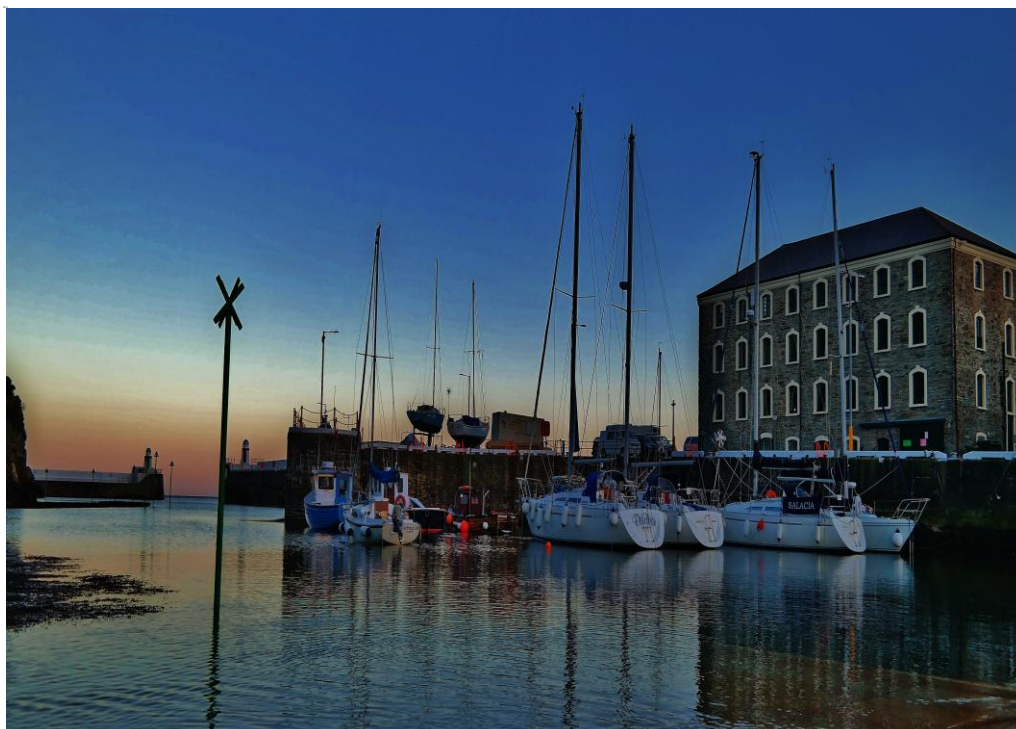
LAXEY HARBOUR

EMAIL YOUR PHOTOS TO LAXEYVIEWS@GMAIL.COM