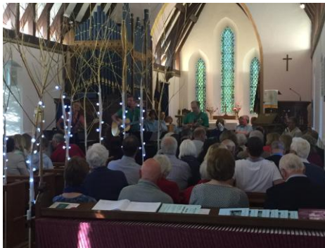
of the entertainment.